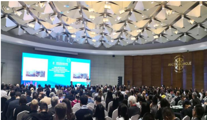
May 10, Marketing & Sales Centre attended Arctic Circle Forum in China.