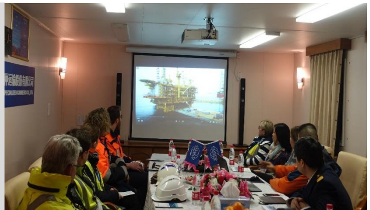
April 18, COSCO SHIPPING Specialized Carriers held pulp business promotion on board MV Tian Xi.