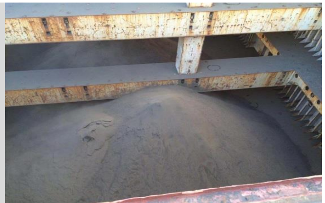
March 30, MV Du Juan Song discharged lead concentrates at Lianyungang.