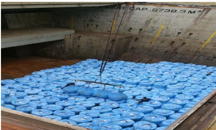
May 15, MV Da Zhi discharged fertilizer at Visakhpatnam.