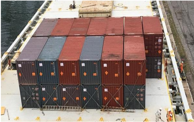
May 16, MV Da Xin discharged DG container at Jakarta port.