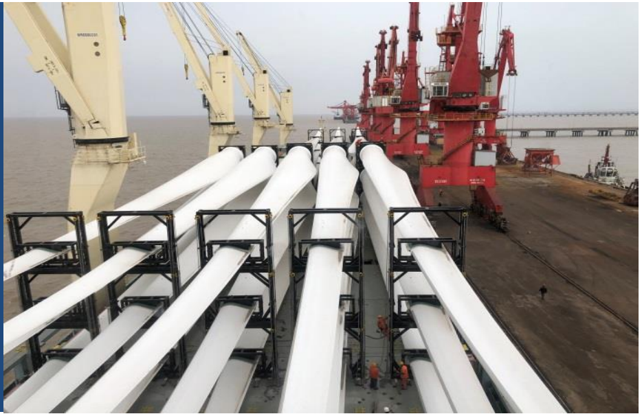
May 11, MV Tian Fu discharged wind power equipment.